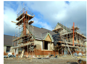
"hotel needs assessment for South Hampshire"