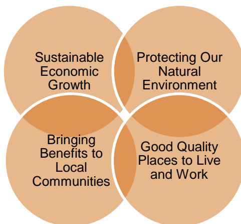
Figure 3: PUSH's Key Ambitions

4.5 We set out below what we mean by these key ambitions. (The 4 ambitions are of equal importance):